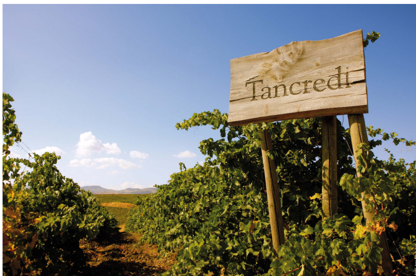
Vigneto Tancredi

The Contessa Entellina and Pantelleria vineyards can be visited in the summer, by reservation. The Contessa Entellina estate is 60 km (37 and a half miles) from Palermo (1 hour by flight from Rome) The island of Pantelleria can be reached from Rome by a 30 minute plane ride.