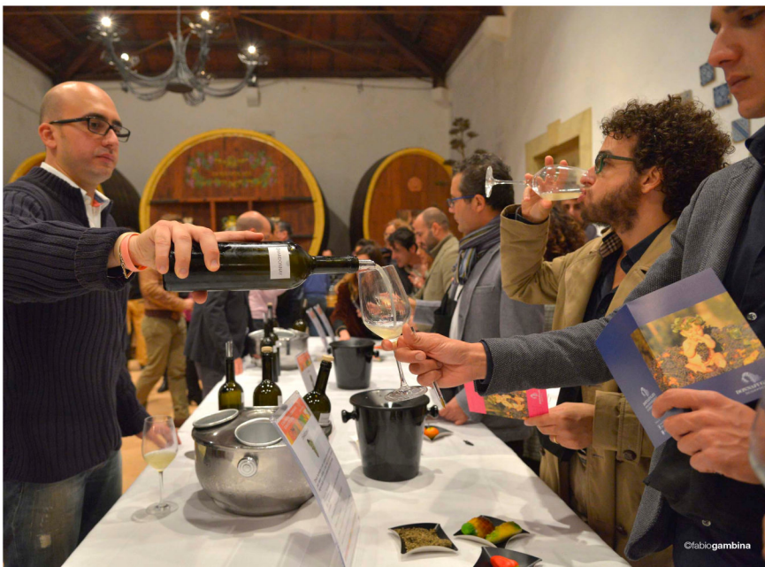
San Marino Festival

Visiting Donnafugata in 2012 were about 11,000 wine tourists from 30 foreign countries.