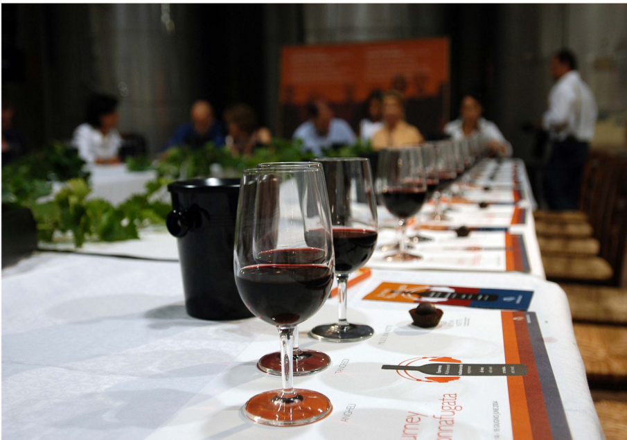
Wine tasting at Donnafugata

Donnafugata warmly welcomes wine tourists in its historic Marsala cellars all year round and during summer at its estates at Contessa Entellina and the island of Pantelleria. It offers guided tours, professional tastings and refined pairings with Sicilian cuisine at charming, relaxing venues.