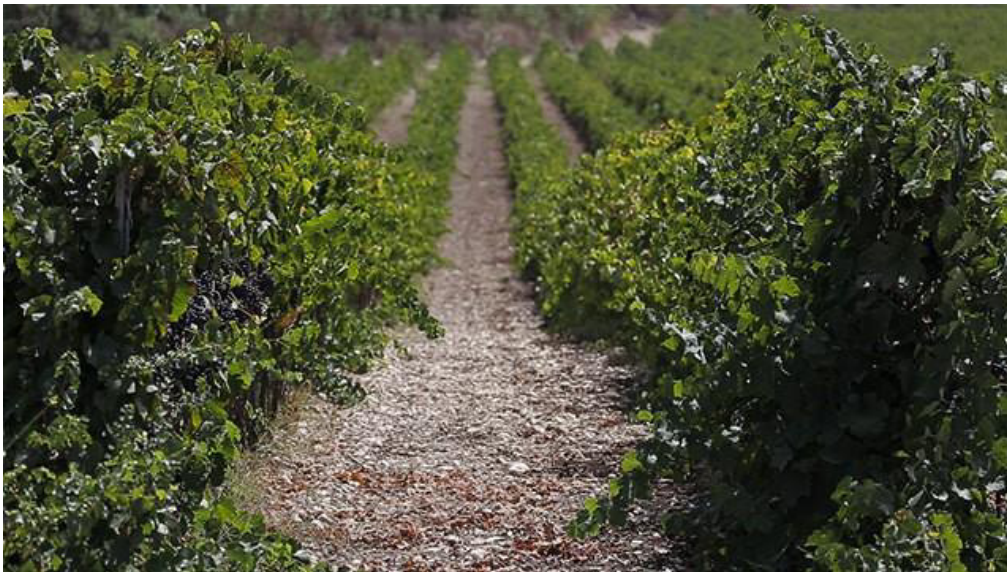
Vittoria Vineyards

The Vittoria DOC area is located in southeast Sicily where Donnafugata has 36 hectares of vineyards in production. Nero d'Avola and Frappato are grown in the territory of Acate and the wines produced here fall under the denomination of Cerasuolo di Vittoria DCG and Frappato DOC. The vineyards enjoy a Mediterranean climate with cooling sea breezes during the summer and a large diurnal temperature range that helps to promote greater acidity in the grapes. The soils are medium-textured, sandy and mingled with calcareous tuff.