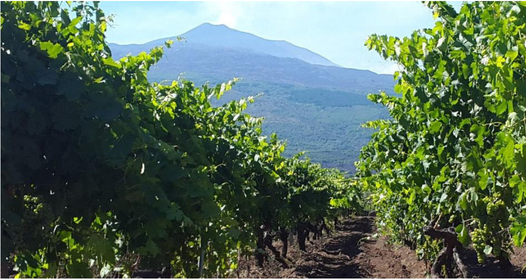
Etna Vineyards

Sul Vulcano Etna Rosso, DOC 2016 is made with 100% Nerello Mascalese, a dark-skinned grape variety that is most commonly grown on the volcanic slopes of Etna. The wine is a soft ruby red with delicate aromas of cherry, strawberry, floral and spice. Tannins and acidity complement each other with a lovely palate of red fruit, sour cherry, sweet spice, and a dash of pepper on a lengthy finish. It is an expressive and impressive wine! Serve with antipasto, stews, grilled fish, meat and spicy Asian cuisine.